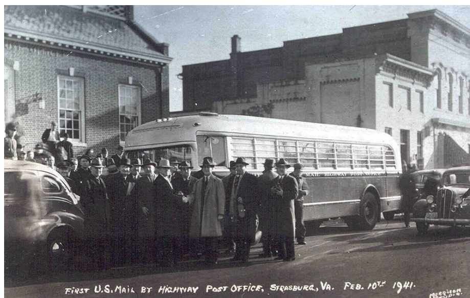
Highway Post Office bus #1 in Strasburg, Virginia, February 10, 1941.

After months of planning, the first trip began on February 10, 1941, and covered 283 miles round trip. The route required two clerks, a clerk-in-charge and a driver who doubled as a mechanic. The route had 23 stops along the way. The bus was to adhere to a strict schedule of time. The clerks would begin their day every morning around 3:30 AM. By the time the driver came in at 5 AM the bus was loaded with mail and he made his final check of the vehicle. The bus left at 5:33 AM and was to arrive at Harrisonburg by 11 AM. Then it would leave Harrisonburg at 4 PM before returning to DC by 9:30 PM so that the mail could be transferred to the trains before midnight. The initial cost of the White bus was $11,960