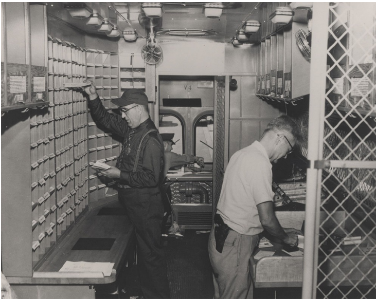
Two clerks sorting mail in HPO bus. The man on the left is sorting letters into the pigeon holes, while the man on the right is canceling envelopes.